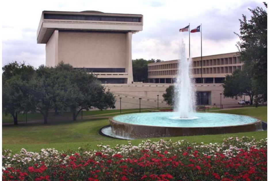
The LBJ Library will be offering tours for ARSC Conference attendees.

As a bonus, conference registrants are likely to find many treasures at the Austin Record Convention. Advertised to be "the largest sale of recorded music in the USA," the convention will take place at the Crockett Event Center, during the weekend of the conference.