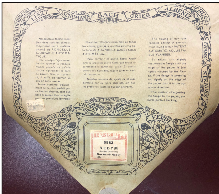
Fig. 2 – Dissemination file for RP_5982P