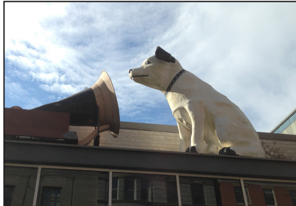
Baltimore sounds beckon Nipper at Maryland Historical Society.