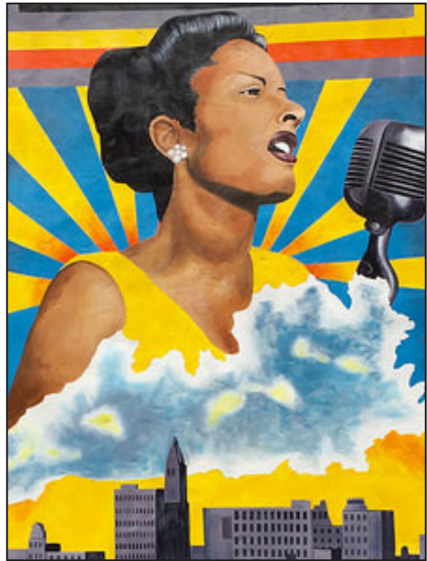
Billie Holiday, Fells Point, MD