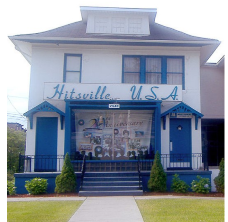
Photo of Motown Museum