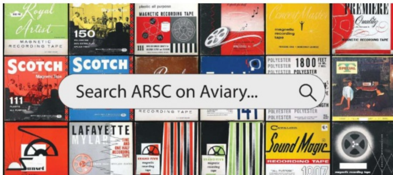
Jazz Loft: Tape Boxes

AVP is proud to support ARSC by hosting past and future conference presentations on Aviary, our publishing platform for audio and video.