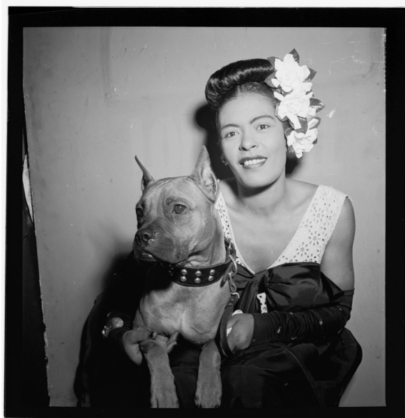
Portrait of Billie Holiday and Mister, Downbeat, New York, N.Y., ca. Feb. Monographic. Photograph.