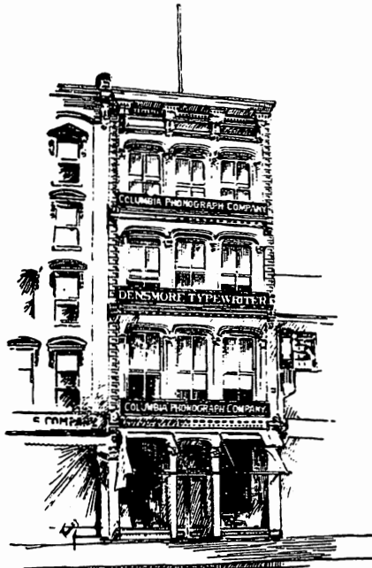
OUR NEW BUILDING.